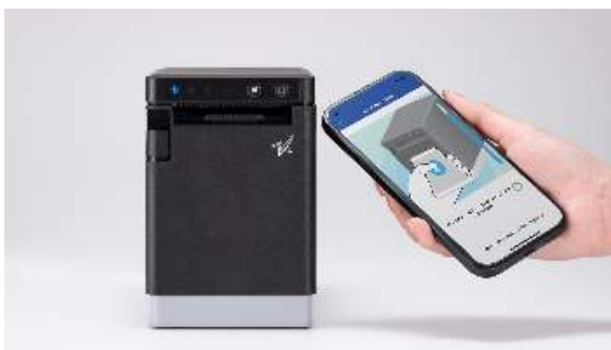
Simple Bluetooth and WLAN set-up via QR code or Star Quick Set-Up Utility