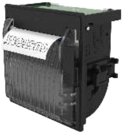
915NB010100333 PRINTER PM2 USB RS232