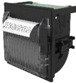
915NB030100333 PRINTING MECHANISM PM2 MEC

Via Berettine, 2 - 43010 Fontevivo PR - VAT: IT02498250345 - TEL: +39 0521 680111 - FAX: +39 0521 610701 - UNIQUE CODE: 8RQN7AZ