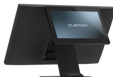
TREK 21.5" with optional 11.6" customer facing display

Scan or click the QR code and find out more about CUSTOM