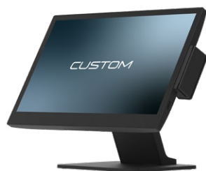
TREK 15.6" with included POS stand and optional MSR

Please visit Custom's website for OS and accessory part numbers.