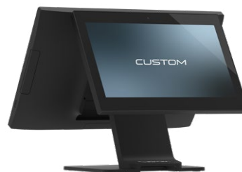
TREK 15.6" with optional 11.6" customer facing display

Scan or click the QR code and find out more about CUSTOM