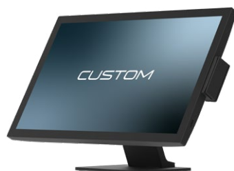
TREK 21.5" with optional POS stand and MSR

Please visit Custom's website for OS and accessory part numbers.