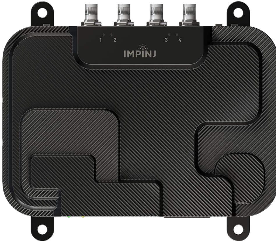
Figure 2: Impinj R700 Series Bottom View